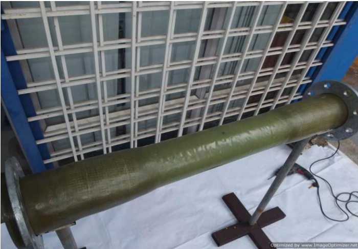
Before FRP pipe