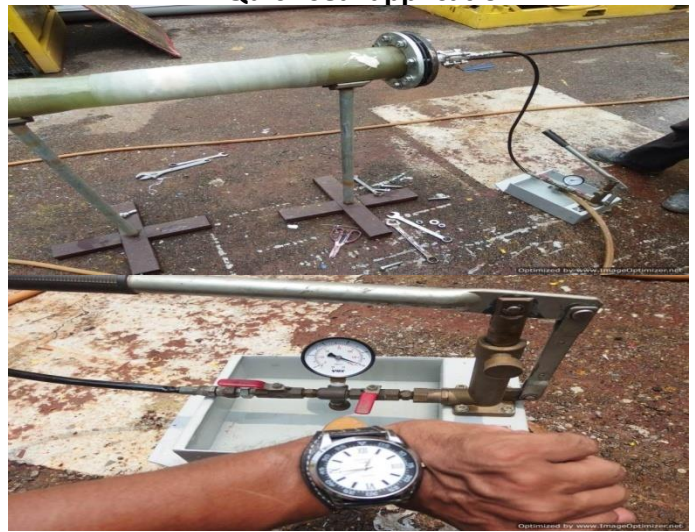
Pressure Test at 150PSI(10bar) – 2days