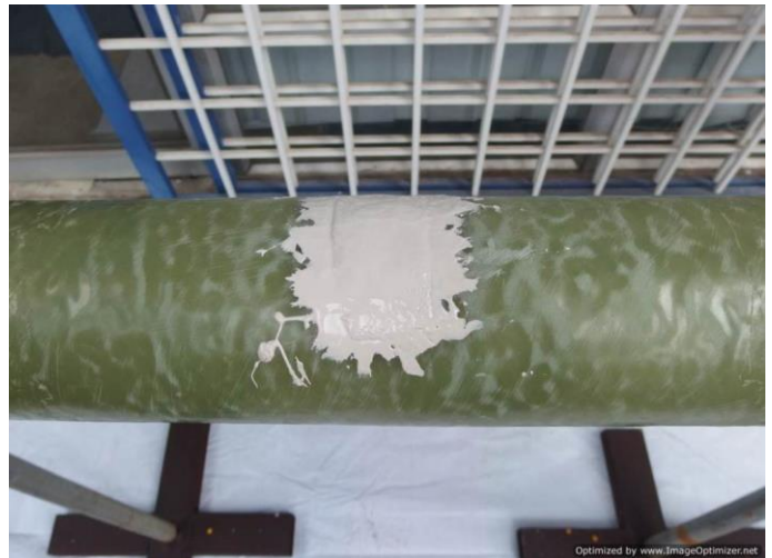
Quick seal application