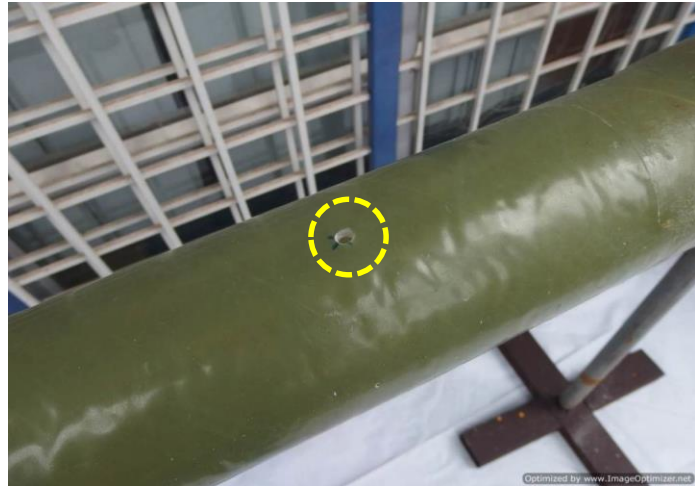
8 mm hole