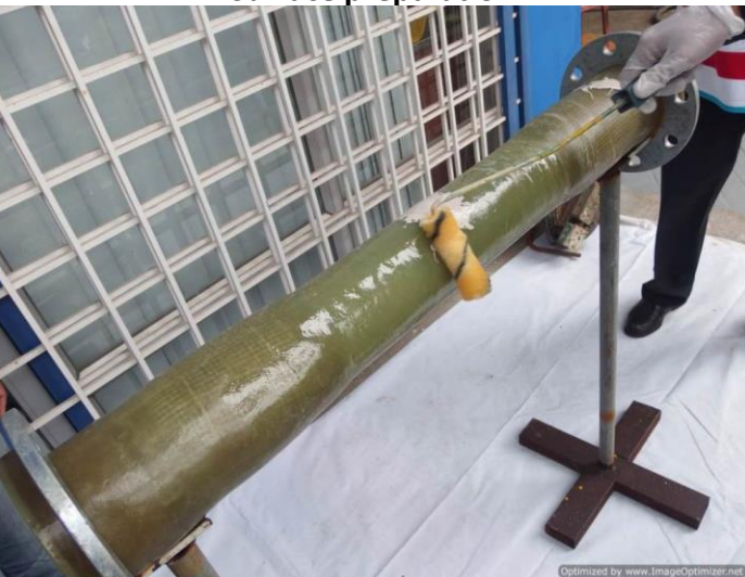
Wrapping with Aqua Sealer clear